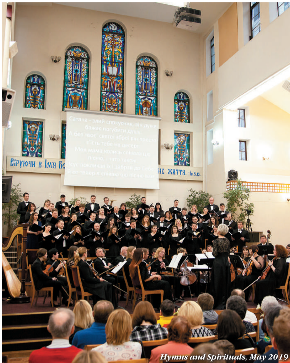
Hymns and Spirituals, May 2019