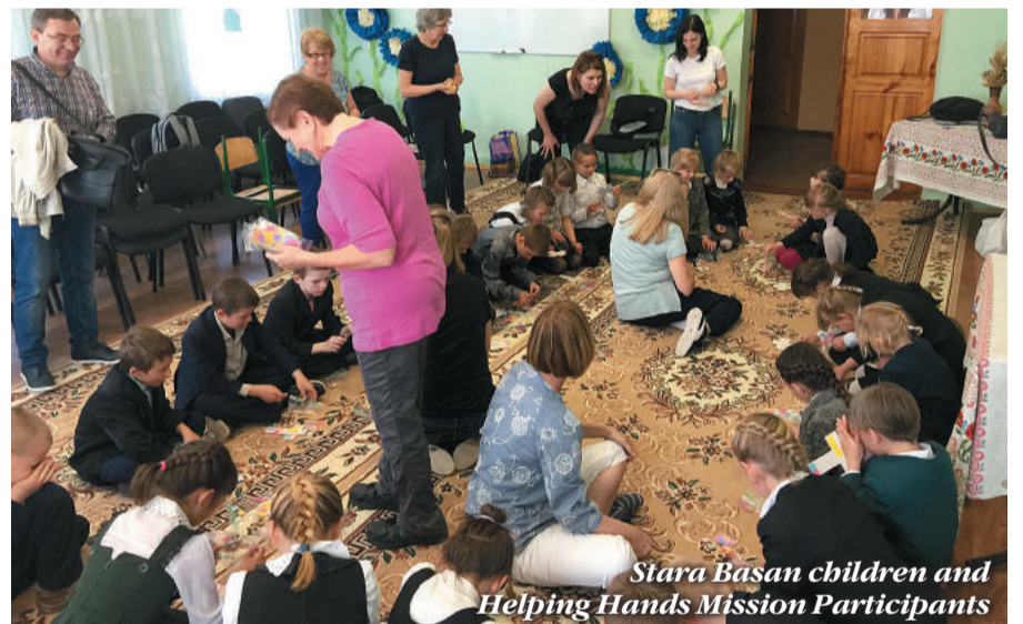
Stara Basan children and Helping Hands Mission Participants