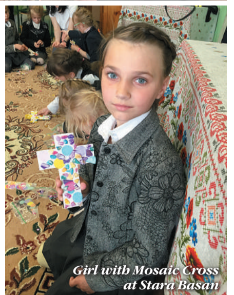
Girl with Mosaic Cross at Stara Basan

Each person who is part of the program is given a ticket when they check in for the service. The MMK team does a great job of registering them each week, but also noticing who is not showing up. This provides the team the opportunity to follow up and check in on the person who missed the study.