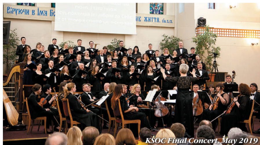
KSOC Final Concert, May 2019