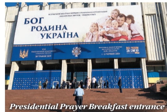
Presidential Prayer Breakfast entrance

Several times the Lord's Prayer was prayed with everyone participating. This was also how the event concluded.