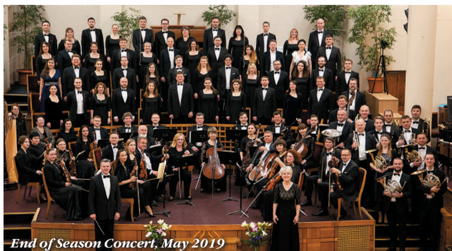
End of Season Concert, May 2019

"The LORD is my strength and my defense; he has become my salvation. He is my God, and I will praise him, my father's God, and I will exalt him". Exodus 15:2