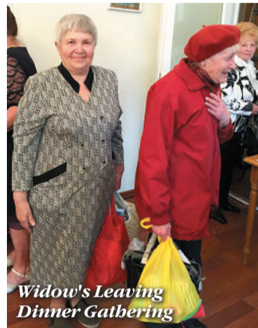
Widow's Leaving Dinner Gathering