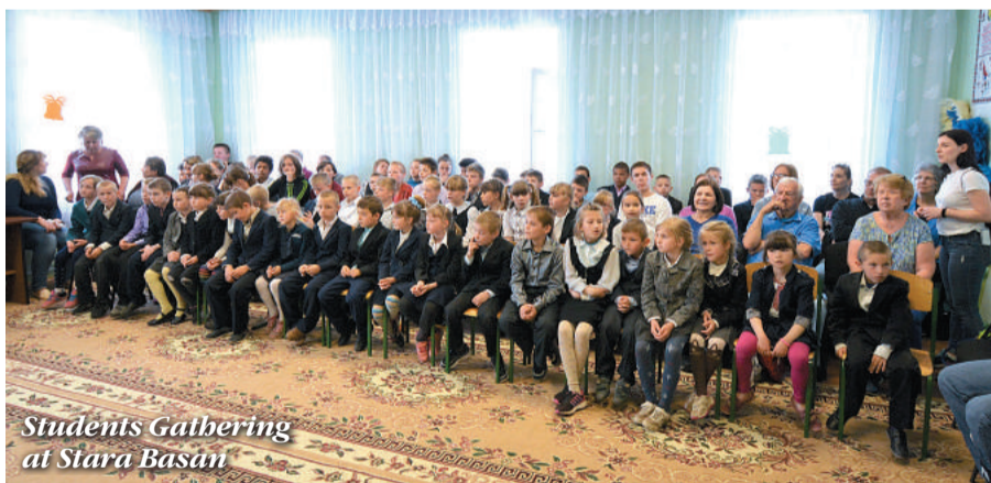
Students Gathering at Stara Basan