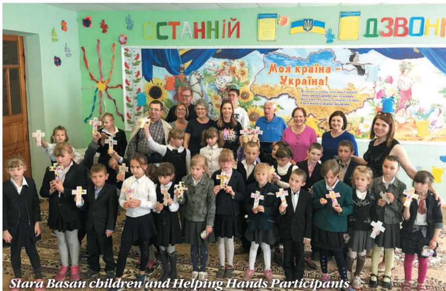
Stara Basan children and Helping Hands Participants