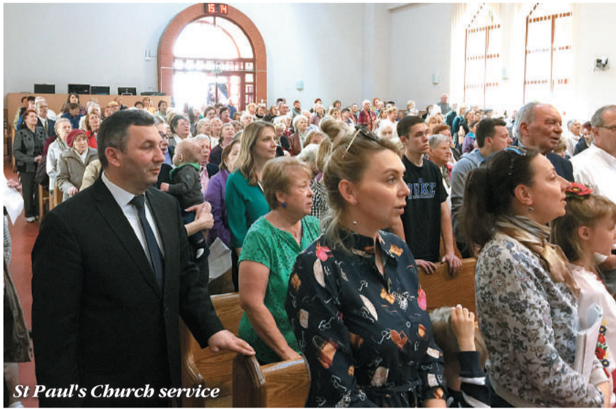
St Paul's Church service

Recently, the group of Americans attending the Helping Hands Mission trip, finished the devotional time with the staff and were encouraged to ask about anything they would like to know about Music Mission Kiev's (MMK) operations there in Kyiv. The dialogue was open and encouraging for everyone. It was amazing to hear how God is working in so many facets of the ministries we serve in Ukraine. MMK has a great team in place in our Kyiv office.