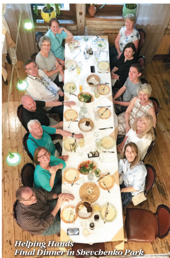
Helping Hands Final Dinner in Shevchenko Park

We also currently serve about 107 home-bound widows. The volunteer Stephen's Ministry team or one of our employees visits the home-bound each week. They communicate to find out what type of food the person needs, then goes to the grocery store and selects the food. They then