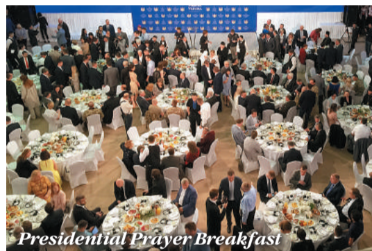
Presidential Prayer Breakfast