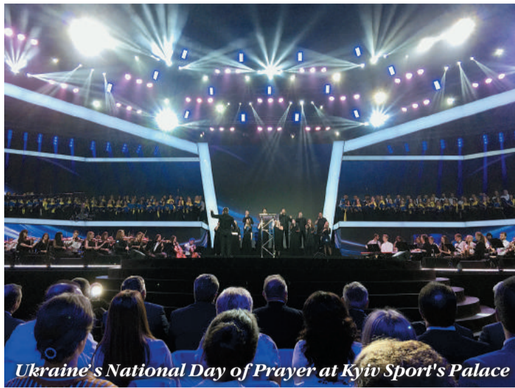
Ukraine's National Day of Prayer at Kyiv Sport's Palace

One major theme heard several times was 2 Chronicles 7:14 which says, "If my people, who belong to me, humble themselves, pray, seek to please me, and repudiate their sinful practices, then I will respond from