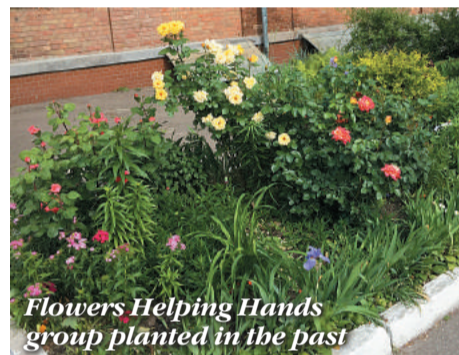
Flowers Helping Hands group planted in the past