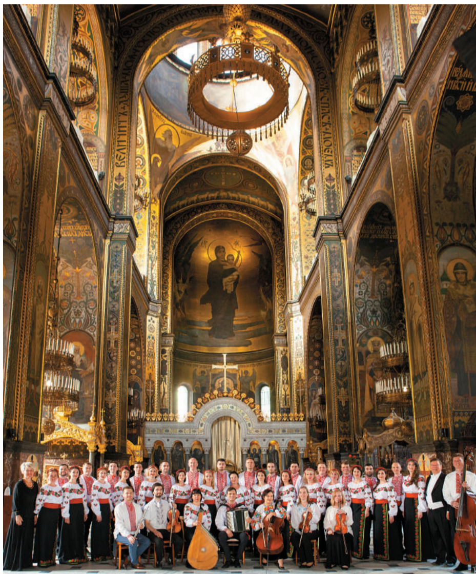
42 members of KSOC are coming to America! Perhaps you know of a church that might host us. See page 4 for OPEN dates.

“But of course, everyone still has to eat. Unfortunately, and I hate to say it, many have been left abandoned. For many, we are their only source for food.