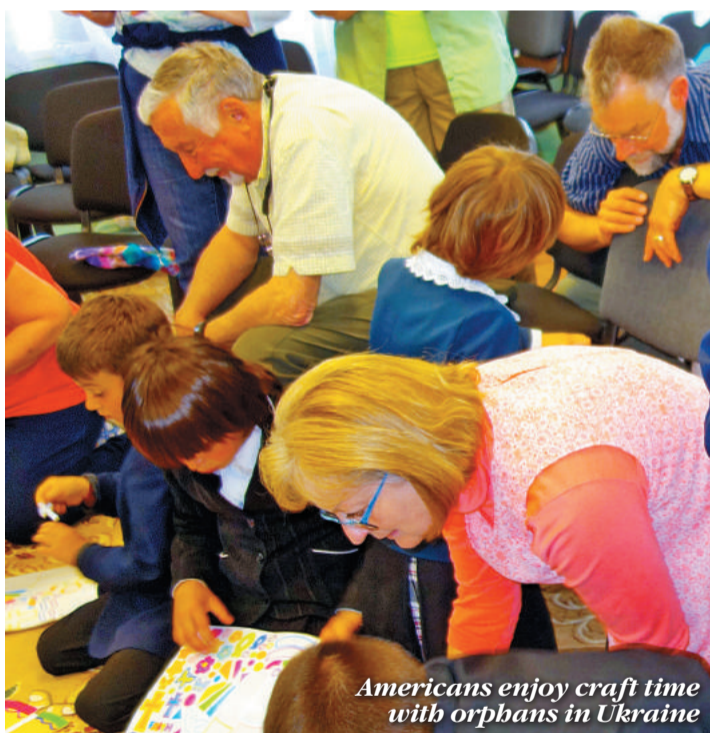
Americans enjoy craft time with orphans in Ukraine