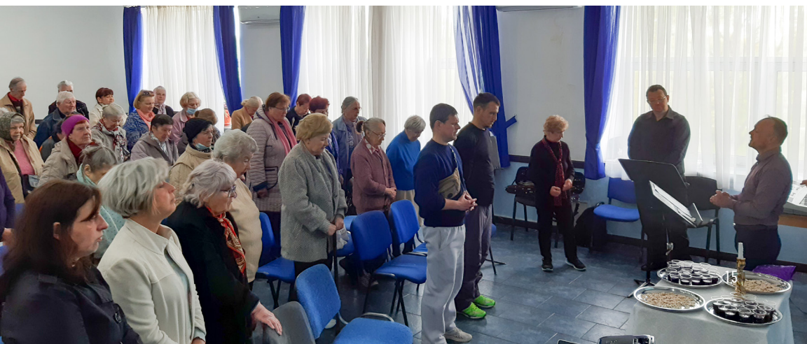
St. Paul's Worship Service on May 7

The Bible lessons for IDPs will be held regularly on Tuesdays, and people are eager to come—they are hungry for God's Word.