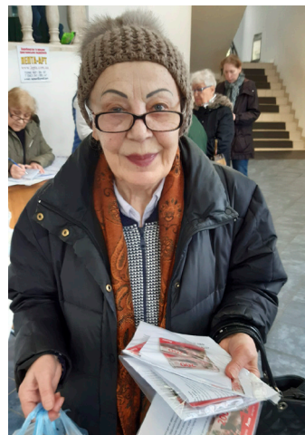
Widows' Gathering on April 28